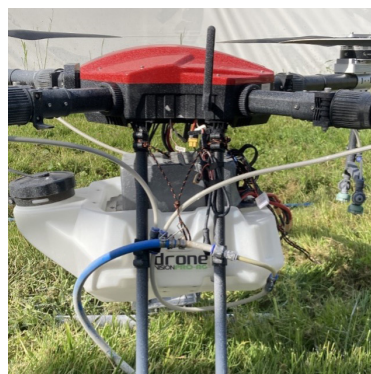
Angers (France): Drone with a hose