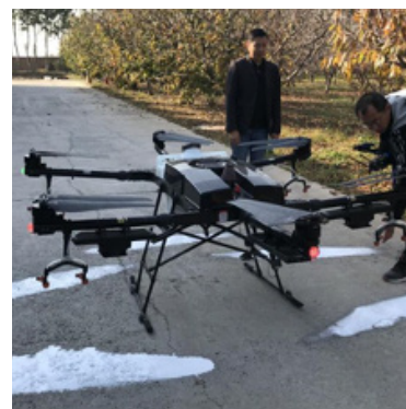
Beijing (China): Drone with tank on board