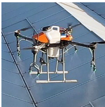
Avignon (France): Drone with tank on board